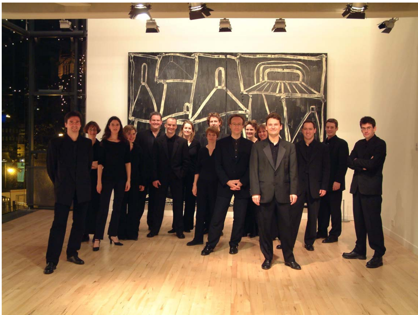
Members of London Musici at Sadler's Wells in 2005.